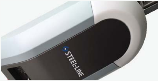
Automatic Garage Door Unit