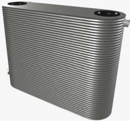
3000L Slimline Water Tank