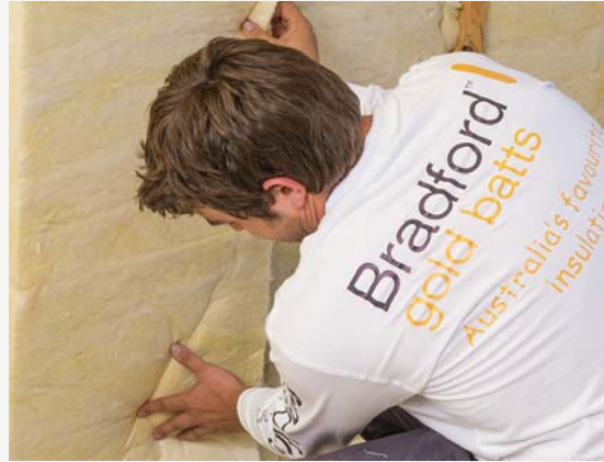
CSR Bradford 2.0 Wall Insulation CSR Bradford 4.0 Ceiling Insulation