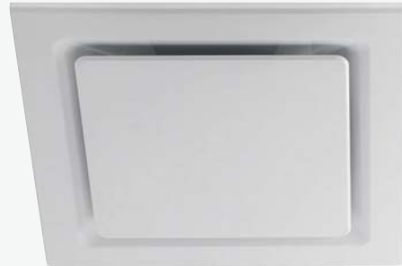
Ducted Exhaust Fans